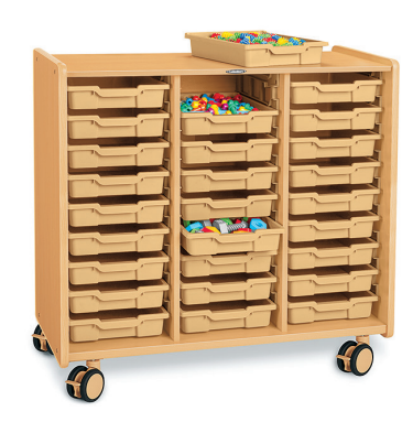
LK233 - Mobile Storage Tray Center 41^{5}/_{8} "w x 18^{3}/_{4} "d x 40^{1}/_{2} "h.