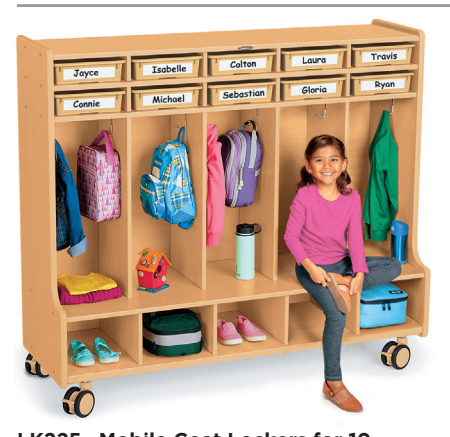
LK225 - Mobile Coat Lockers for 10 59^{3}/_{4} "w x 20^{1}/_{8} "d x 52^{1}/_{4} "h. LM126 - Natural Color Storage Trays - Set of 10