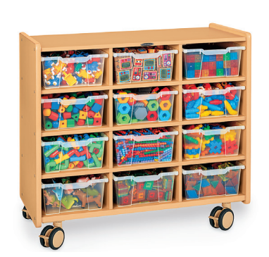
LK331 - Mobile Big Bin Storage Unit 40^{1}/_{2} "w x 18^{3}/_{4} "d x 37^{1}/_{4} "h. LM122 - See-Inside Bins - Set of 12