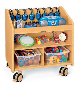
LK334 • Mobile Listening Center 31"w x 18<sup>3</sup>/<sub>4</sub>"d x 31<sup>1</sup>/<sub>2</sub>"h. LK340 • See-Inside Bins - Set of 2