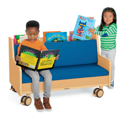
LK336 • Mobile Reading Bench 42"w x 211/2"d x 26"h.