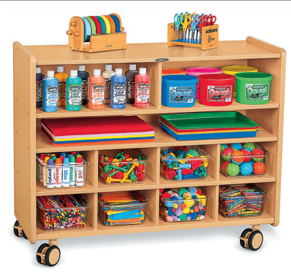
LK230 - Mobile Holds-It-All Storage Unit 46\frac{1}{2} "w x 18\frac{3}{4} "d x 38"h.