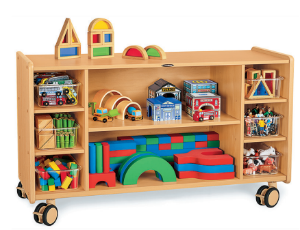
LK227 • Mobile Cubbies & Shelves Storage Unit 54"w x 18^{3}/_{4} "d x 31^{1}/_{2} "h.