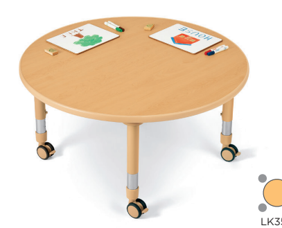
Mobile Round Tables