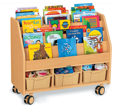
LK244 • Mobile Book Center 42"w \times 18^3/_4"d \times 35^{1/2}"h . LM145 • Natural Color Big Bins - Set of 3