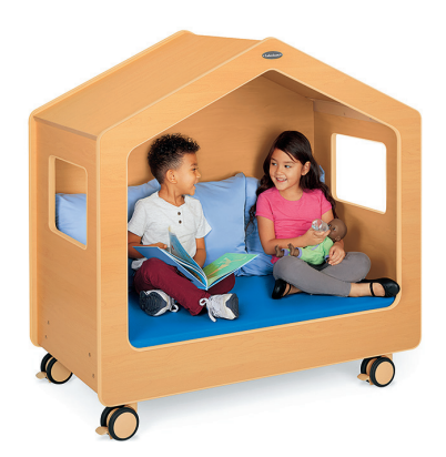
LK108 • Mobile Classroom Nook 47^{3}/_{8} "w x 26^{1}/_{4} "d x 47^{7}/_{8} "h.

LK232 • Mobile All-Purpose Storage Unit 46\frac{1}{2} " w x 18\frac{3}{4} " d x 38 " h.