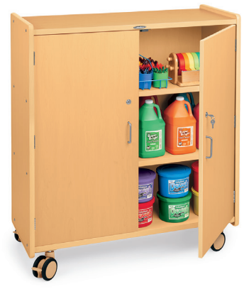
LK333 • Mobile Locking Storage Cabinet 42"w x 18^{3}/_{4} "d x 48"h.