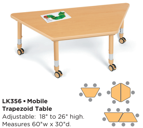
LK357 • Mobile Group Table

Adjustable: 18" to 26" high. Measures 72"w x 48"d.