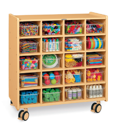
LK332 - Mobile Cubby Storage Unit 41^{3}/_{4} "w x 18^{3}/_{4} "d x 43^{1}/_{4} "h. LK135 - Clear-View Bins - Set of 20